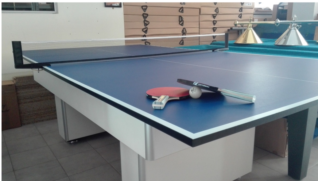
TABLE TENNIS CONVERSION TOPS